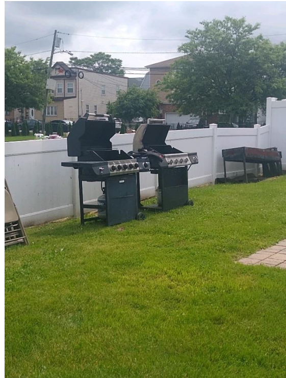
Outside, lawn's cut, grilles clean. Now to clean out the firepit. Logan once again made sure the job was done right!