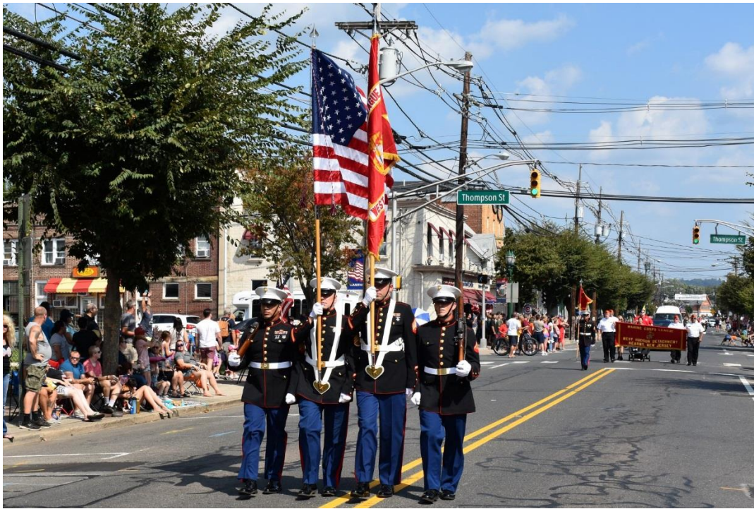
West Hudson Color Guard! Looking sharp, leading the way!