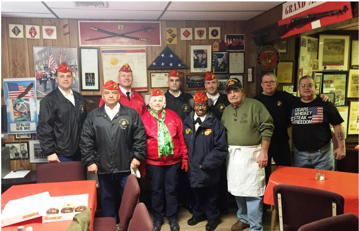
A great job done, as always!!!! And a special thanks to our Ladies Auxiliary, always supporting us!