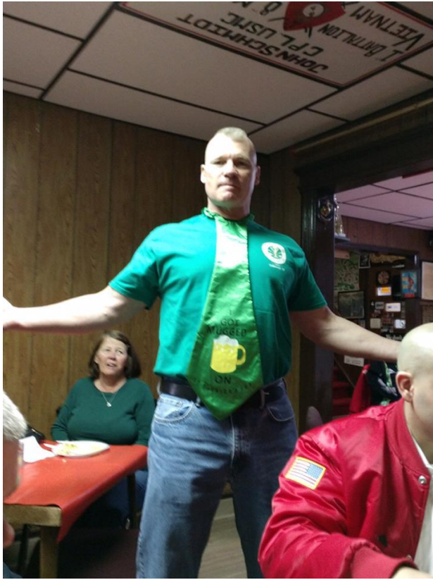
Even wore his formal tie!