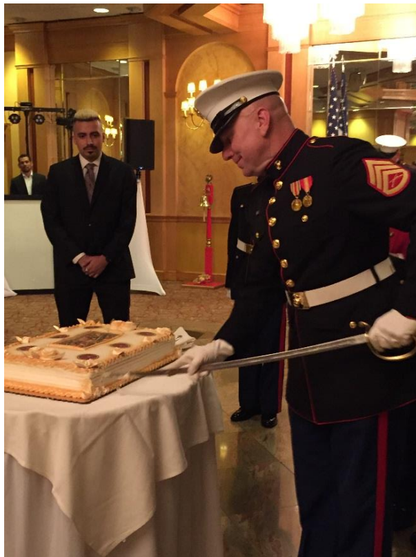
Continuing the tradition, the 1 st piece of cake shared by the youngest and most senior Marines.