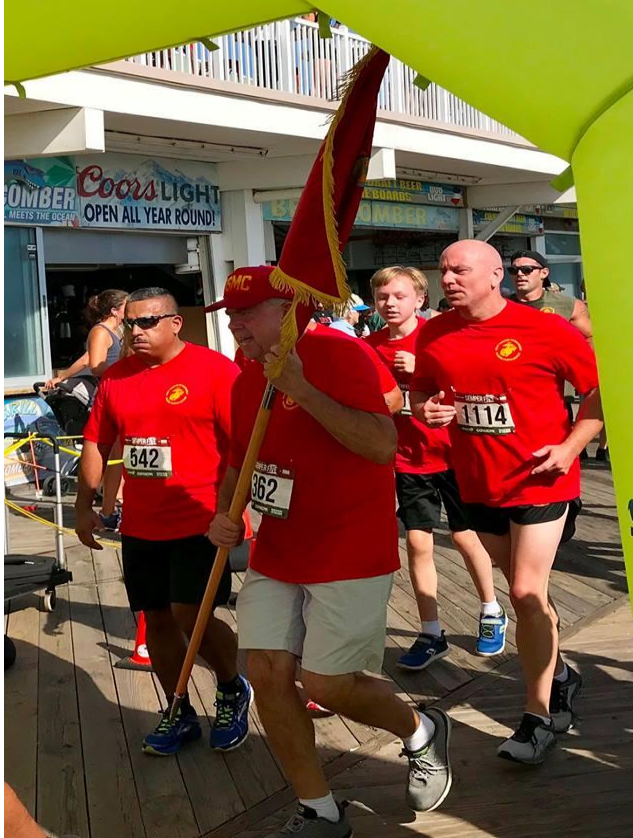
And then, the awards! Well earned all !