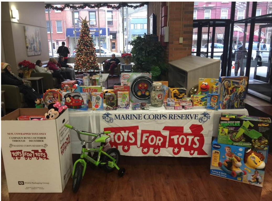
On the 10 th , troops assisted with a collection for our Gifts for Children , hosted by Hells Kitchen Lounge, Newark, N.J. Our sincere thanks go out for the event and the gifts.